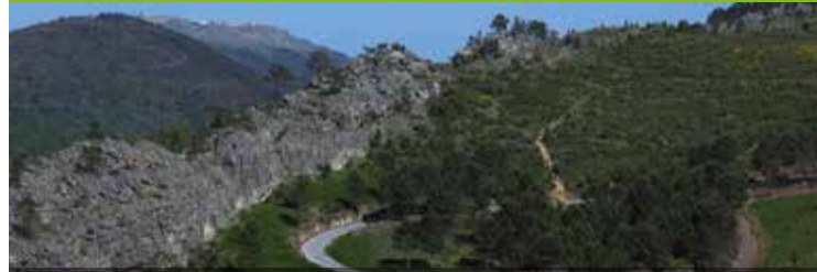
Geological fracture of Castelo de Vide