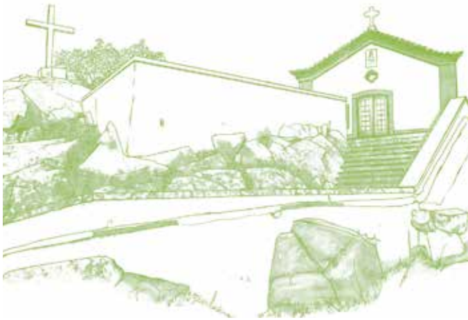
Chapel of N. Sr.ª da Penha. On the top of the rocky outcrop, a place of worship, a viewpoint over Alto Alentejo.

The path begins at Castelo de Vide near the Church of N. Sr.ª dos Remédios, following a gently descending pathway until it crosses the water courses that will form the São João River. Leaving the urban area we stay on the path, climbing up the northeastern slope of the Serra de São Paulo. At a certain point we notice the misalignment of the quartzite outcropping, evidence of a geological fracture with an oblique slip. The range of views over the village increases step by step. The Santa Fountain is a perfect place to rest and enjoy the landscape. From here the path will follow a very well preserved section of a medieval stone-paved roadway which leads us to the culmination of the journey: the Chapel of N. Sr.ª da Penha. The location gives us a view of the landscape that, from west to east, stretches to the distant horizons. Here, the more adventurous ones can enjoy a via ferrata (an itinerary laid out along the rock walls of a mountain). We resume the path downhill by the municipal road, but soon we will move onto an old medieval stone-paved roadway that will lead us to the Alminha of S. Paulo. In a gentle descent we reach the Nova Fountain, next to the EN246 road. Carefully, we across this road and we continue until we come to the São João River, which is no longer the trickle of water that we saw at the beginning of our walk. Here we begin the last climb that will bring us back to the centre of Castelo de Vide.