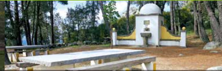
Fountain of Sr.ª da Penha